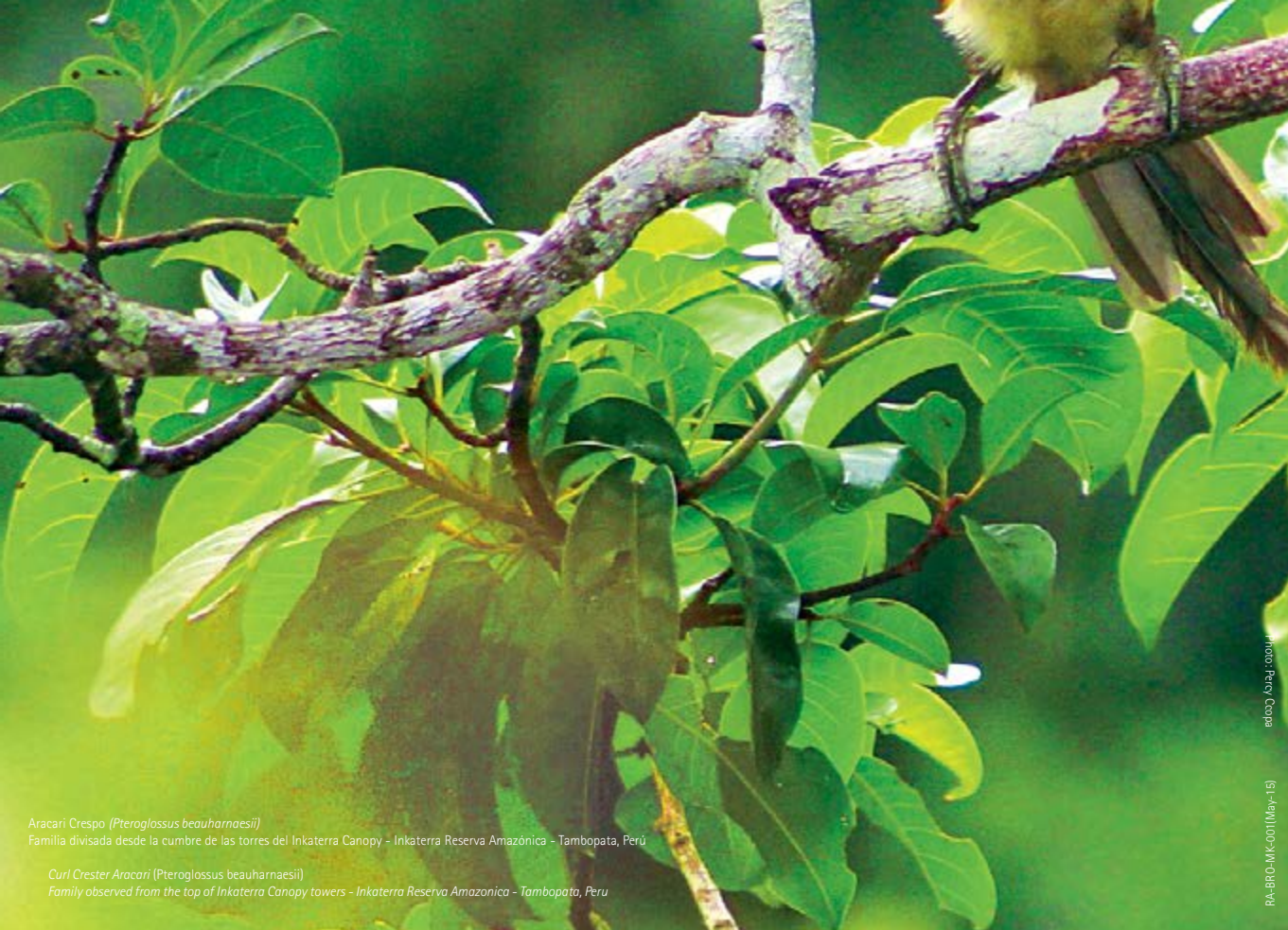
Aracari Crespo ( Pteroglossus beauharnaesii ) Familia divisada desde la cumbre de las torres del Inkaterra Canopy - Inkaterra Reserva Amazónica - Tambopata, Perú